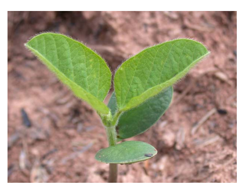
Photo 2. Close-up of soybean plant in the VC or Cotyledon stage since the unifoliate leaves have unrolled sufficiently that the leaf edges to not touch and the next leaf (a trifoliate leaf) has not grown enough that the leaf edges of the three leaflets have unrolled enough to no longer touch.

Photo 1. Soybean plants in the VC or Cotyledon stage since the unifoliate leaves have unrolled sufficiently that the leaf edges to not touch and the next leaf (a trifoliate leaf) has not grown enough that the leaf edges of the three leaflets have unrolled enough to no longer touch.