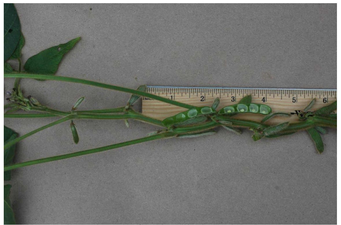
Photo 1. Soybean pods with seed that is 1/8^{th} of an inch (about 3 mm) long at one of the four uppermost nodes on the main stem with a fully developed leaf is considered at the R5 or Beginning Pod stage.

The R5 or Beginning Seed stage occurs when on 50% or more of the plants in a field you can find a seed 1/8 of an inch long (just slightly greater than 3 mm) in a pod at one of the four uppermost nodes on the main stem with a fully developed leaf (Photo 1). This occurs in pods earlier than we often think (Photo 2) as pods may be only an inch long. The tendency for most of us is to wait to call a plant in the R5 stage when we can either easily see the seed developing in the pod or can easily feel the seed in the pod. Usually by this point, the seed has grown to about a <sup>1</sup>/<sub>4</sub> inch in length.