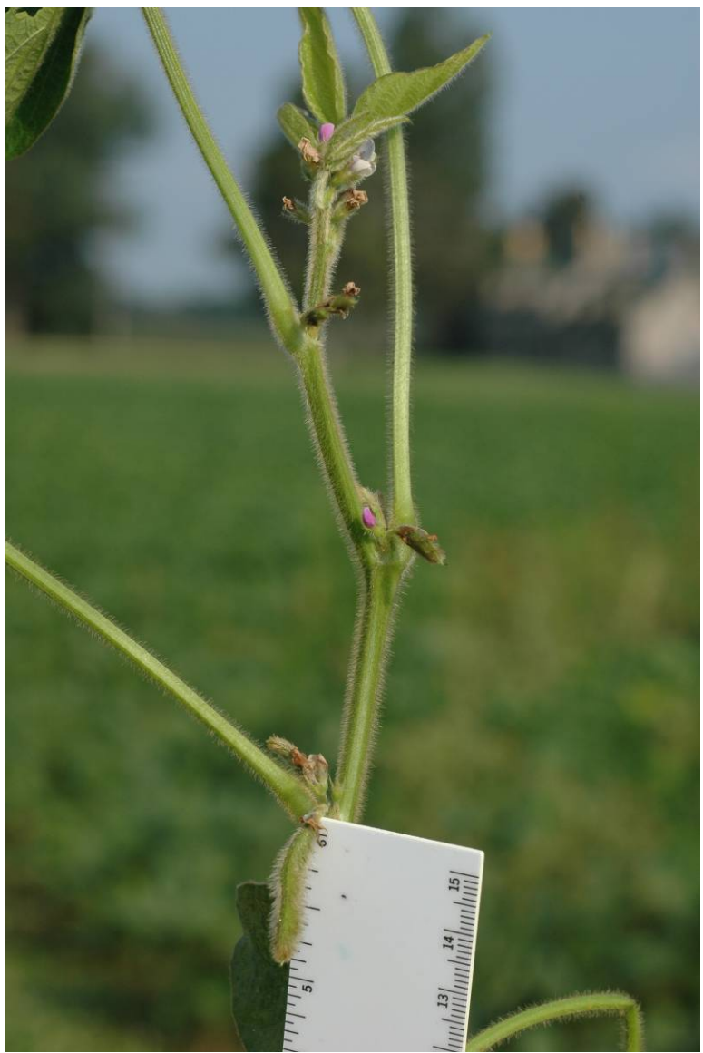
Photo 3. Soybean plant in the R4 or Full Pod stage at which time a pod 3/4 of an inch long (about 19 mm) has formed at one of the four uppermost nodes on the main stem with a fully developed leaf

Frequently, fungicide applications for soybean health and yield enhancement are applied at either the R3 or R4 growth stage. Yield response to this type of fungicide application usually averages from 3 to 6 bu/A; but, in demonstration and research trials across the country, the range has been from yield loss to large yield increases depending on the individual situation. In these trials, the frequency of yield responses and the actual yield responses suggests that this type of application under good growing conditions can usually return enough to cover the costs involved. In trials in this region, we have found about a 3 to 5 bu/A increase in each of the trials we've conducted. A possible downside has been a delay in maturity and increase in the number of green stems on beans at the time they reach harvest moisture. Although the fungicide applications should help soybean health at harvest, this factor was improved in only one of the three site-years in our studies.