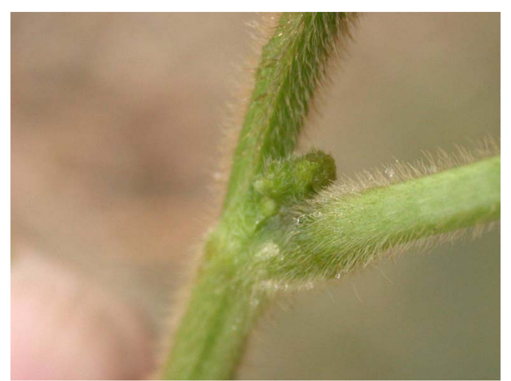
Photo 2. Close-up of leaf axil showing developing flower buds of a soybean plant.

Beginning Bloom or R1 occurs when there is one open flower at any node on the main stem in at least 50% of the plants in the field. Photo 2 shows a view of the flower buds that form in each leaf axil and Photo 3 shows a flower open and in bloom.