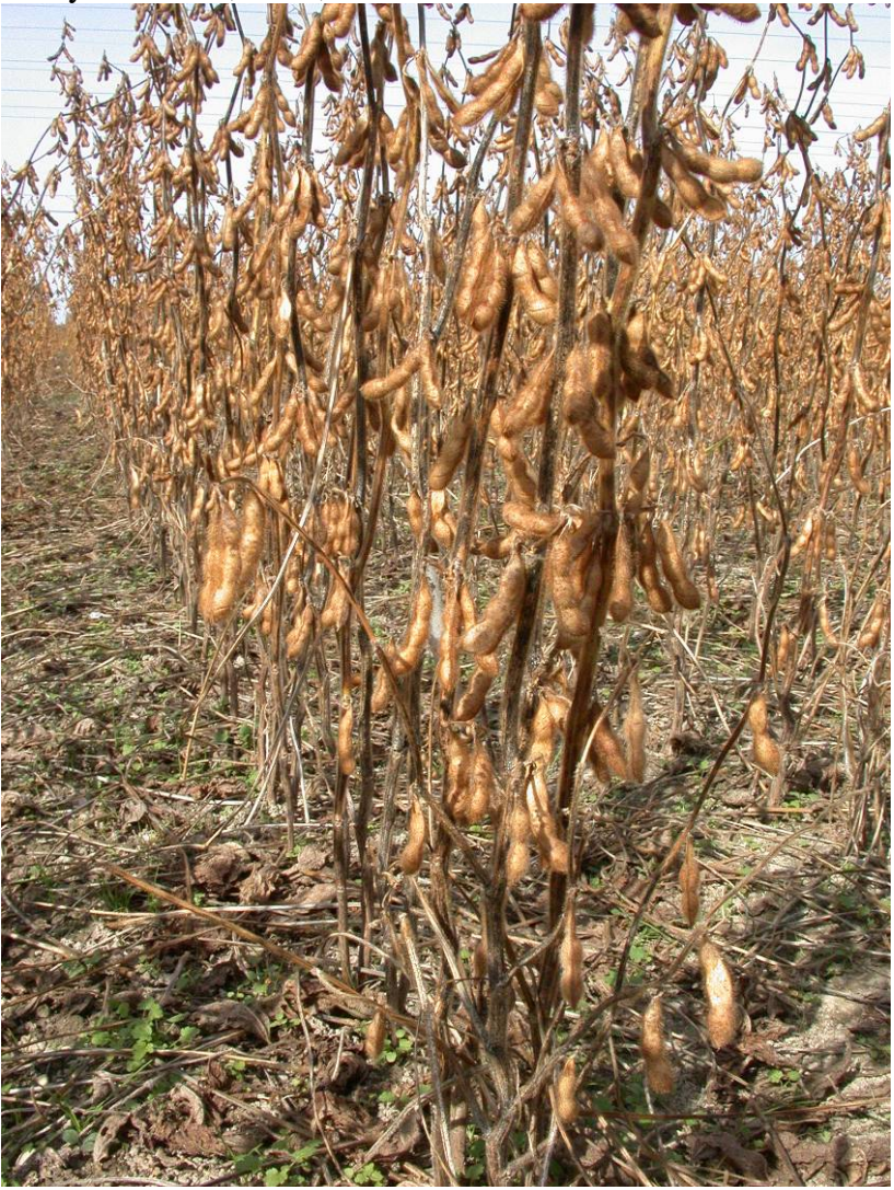
Photo 2. Soybean plants in the R8 or Full Maturity stage at which time 95% of the pods have reached their maturity pod color

Full maturity occurs when 95% of the pods have reached their mature pod color (Photo 2). At full maturity, there is no longer an increase in yield due to seed fill since the abscission layer has formed cutting the beans off from the rest of the plant. From this point on, the process is essentially a matter of the seeds losing enough moisture to reach the point when they can be safely harvested, dried, or stored.