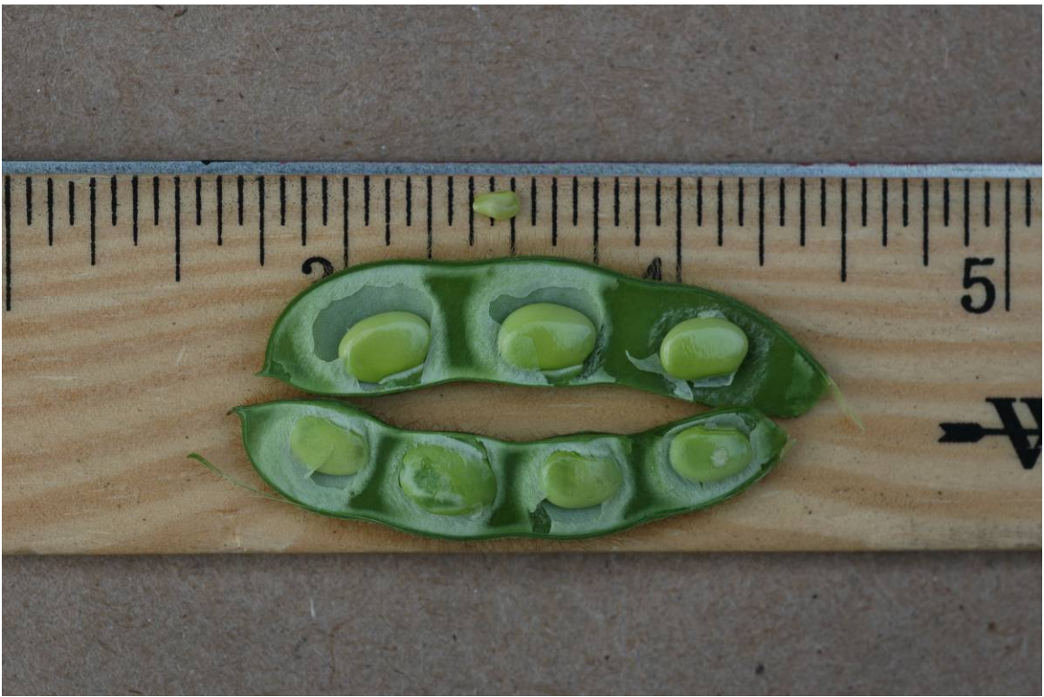
Photo 2. A comparison of seed size between a seed just at the R5 stage and seed in a soybean pod that can be felt and might be thought to have reached R5. Note seed at this later stage is slightly larger than a \frac{1}{4} inch in size versus the 1/8^{\text{th}} inch for R5.

The R6 or Full Seed stage begins when a pod that contains a green seed that fills the pod cavity occurs at one of the four uppermost nodes on the main stem with a fully developed leaf (Photo 3). Again, one-half of the plants in the field must be at this stage. Often this stage lasts longer than the other reproductive stages and, depending on weather and soil conditions, it can last many weeks. Towards the end of R6, soybean leaves begin to show a bright yellow color that often is accompanied by the shedding of the lowest leaves. Leaf drop follows leaf yellowing as scenescence of the crop begins (Photo 4). The next stage (R7) usually occurs when 80 to 90 percent of the leaves have fallen from the plants but when strobilurin fungicides have been applied leaf drop may be delayed past R7.