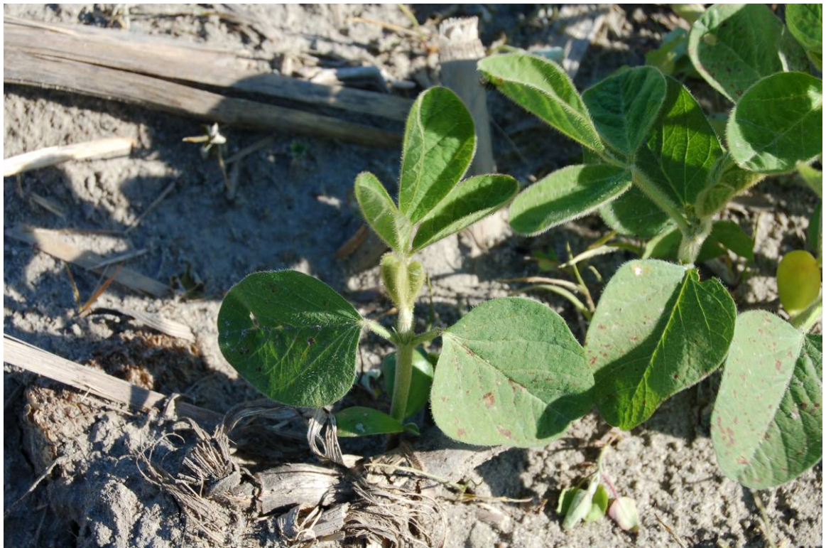
Photo 1. Soybean plants in the V1 or First Node stage at which time the leaflets on the first trifoliate leaf to emerge have unfurled enough so the leaflet edges no longer touch. This means that the unifoliate leaves are now fully developed leaves.

To continue the description of soybean growth stages, we now move on to the 'First Node' growth stage. Again, you should refresh your memory of the definitions covered in the first of this series so you will understand what a fully developed leaf is. V1 begins when the leaflets of the first trifoliate leaf to emerge have unrolled sufficiently that the leaflet edges do not touch (Photo 1 below). The stage continues until V2 or the 'Second Node' stage when the first trifoliate leaf becomes a fully developed leaf (Photo 2).