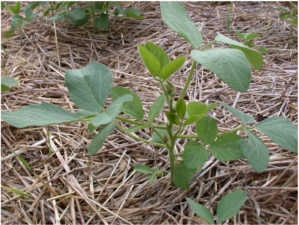
Photo 1. Soybean plants in the V6 or Sixth Node stage at which time the leaflets on the sixth trifoliate to emerge have unfurled. This means that the fully developed leaves include the unifoliate leaves and the first to the fifth trifoliate leaves

To continue soybean growth staging for the V-stages, count the number of nodes on the main stem with fully developed leaves. Remember that a leaf is fully developed when the leaf immediately above it on the main stem has opened so that the leaflet edges have opened or unrolled enough so that the leaflet edges do not touch. The V6 stage is illustrated in Photo 1 below.