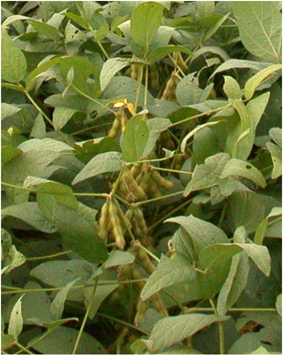
Photo 3. Soybean pods with green seed that fill the pod cavity completely on the uppermost four nodes on the main stem with a fully developed leaf.