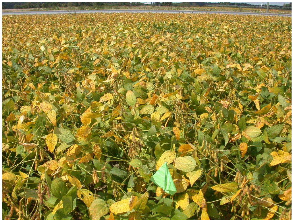
Photo 1. Soybean plants in the R7 or Beginning Maturity stage at which time at least one normal pod that has reached its mature pod color can be found on the main stem of 50% of the plants in the field

The R7 or Beginning Maturity stage is illustrated in Photo 1 below but note that these beans had been sprayed with the fungicide, Headline, at the R3 stage and has resulted in delayed leaf drop. When fungicides have not been used, the soybeans at this stage often have dropped most if not all of their leaves. Limited yield increases will occur once this stage is reached since an increasing number of seed from this point on will have reached their full size and weight. On irrigated beans when soil moisture is adequate, irrigation should cease between the middle of R6 and R7 to allow the soil to begin to dry out for harvest. Stop irrigation at the earlier stage if there is enough moisture in the top and subsoil to carry the beans to maturity. With the price of diesel nearly double that of last year and the low price for soybeans, the earliest possible date for cutting off irrigation could be a more profitable choice this year rather than aiming to capture the maximum possible yield potential from the beans. Aerially seeded cover crops usually are flown on either in late R6 (Full Seed) stage or, where strobilurin fungicides have been used and leaf drop is unusually delayed, at this (R7) stage when about 20% of the leaves have dropped off the plants.