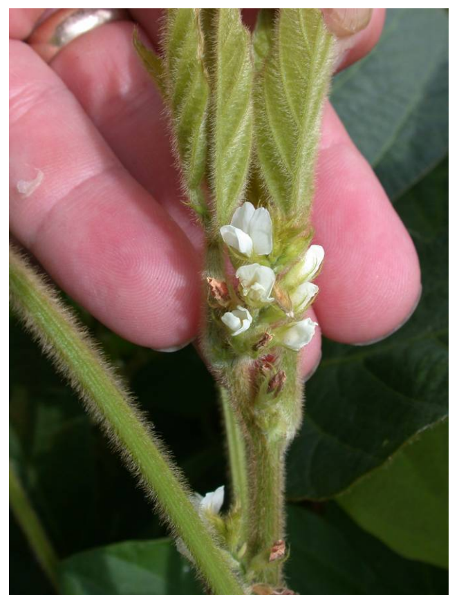
Photo 1. Soybean plants in the R2 or Full Bloom stage at which time blooms have open at one of the two uppermost nodes on the main stem with a fully developed leaf

The R2 or Full Bloom stage is illustrated in Photo 1 below. Full bloom occurs when an open flower occurs at one of the two uppermost nodes on the main stem with a fully developed leaf. At least half the plants in the field must be at this stage for the field to be called in full bloom. Stresses of any type become critical at this and later stages since they can severely limit the number of flowers, pods, or seed set by the crop. When and where possible, stress factors should be eliminated prior to bloom. Maximum yield potential generally occurs if canopy closure occurs ten days to two weeks prior to the bloom stage.