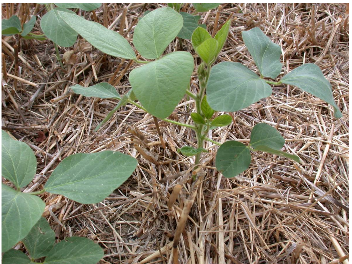
Photo 2. Close-up of soybean plant in the V5 or Fifth Node stage. At this stage a set of unifoliate leaves and four trifoliate leaves are fully developed. The plant is entering a period of rapid growth if adequate moisture, nutrients, and sunlight are available. Note that at low populations the plant is beginning to produce branches and additional trifoliate leaves on the branches. The branch leaves are not counted in the staging of soybeans. Only those leaves that occur on the main stem are counted for staging soybeans.

In late-planted double crop beans, flowering can begin once the plant reaches the V4 stage of growth although in single-crop plantings flowering will not occur until the days shorten to the appropriate day length (actually the night's lengthen to the point at which the variety is triggered to turn reproductive) following the longest day of the year (June 21).