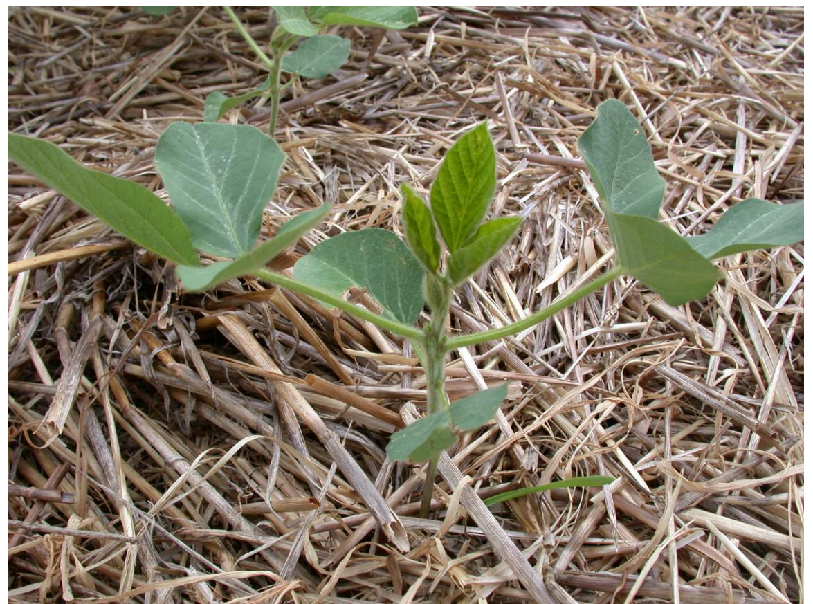
Photo 1. Soybean plants in the V3 or Third Node stage at which time the leaflets on the third trifoliate leaf to emerge have unfurled enough so the leaflet edges no longer touch. This means that the fully developed leaves include the unifoliate leaves and the first and second trifoliate leaves

Continuing the description of soybean growth stages, we move to the 'Third', 'Fourth,' and 'Fifth Node' growth stages. Again, refresh your memory of the definitions covered in the first of this series so you will understand what a fully developed leaf is. V3 begins when the leaflets of the third trifoliate leaf to emerge have unrolled sufficiently that the leaflet edges do not touch (Photo 1 below). The stage continues until V4 or the 'Fourth Node' stage when the newly emerged third trifoliate leaf becomes a fully developed leaf (the fourth trifoliate leaf has emerged enough for the leaflet edges to no longer touch). The 'Fifth Node' stage occurs when counting from the soil level you have a set of unifoliate leaves (or leaf scars if these leaves have dropped off), and four fully developed trifoliate leaves (Photo 2).