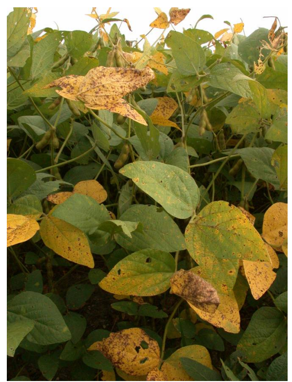
Photo 4. Soybean leaf drop begins towards the end of growth stage R6 and often shows up as an intense yellowing of the field (Photo courtesy of R. Taylor).

Photo 3. Soybean pods with green seed that fill the pod cavity completely on the uppermost four nodes on the main stem with a fully developed leaf (Photo courtesy of R. Taylor).