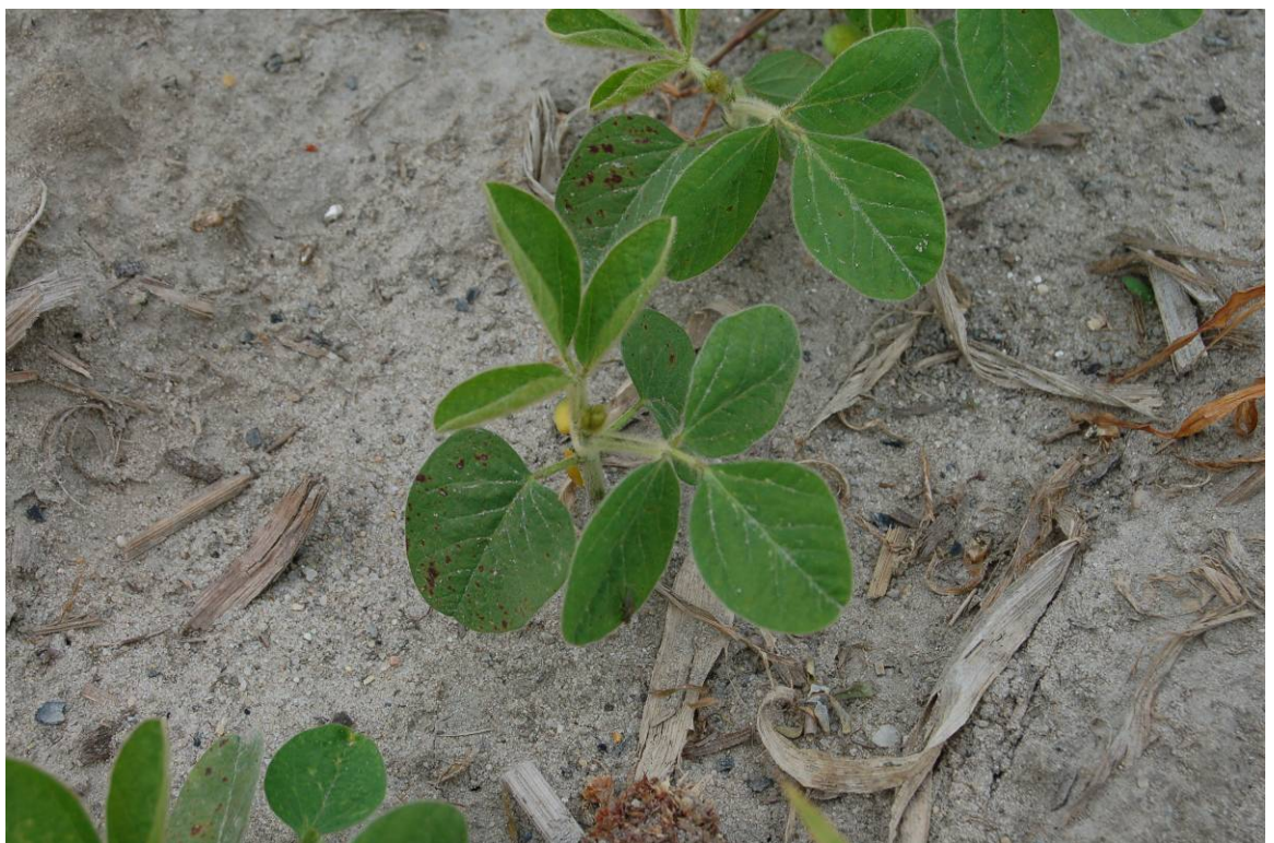
Photo 2. Close-up of soybean plant in the early V2 or Second Node stage. At this stage both the unifoliate and the first trifoliate leaves are fully developed. The plant is entering a period when enough leaf area is present that if adequate moisture, nutrients, and sunlight are available that growth will become very rapid (Photo courtesy of Cory Whaley).

application of glyphosate but there are some precautions to follow to prevent Mn from interfering with weed control. Tests have shown EDTA Mn to be safe when mixed with Roundup sprays but other Mn products can reduce weed control if not handled properly. Always add ammonium sulfate at a rate of 1 to 2 percent by weight or 8.5 to 17 pounds per 100 gallons before either adding the glyphosate or techmangam. This will prevent the Mn products from binding to glyphosate and reducing its performance.