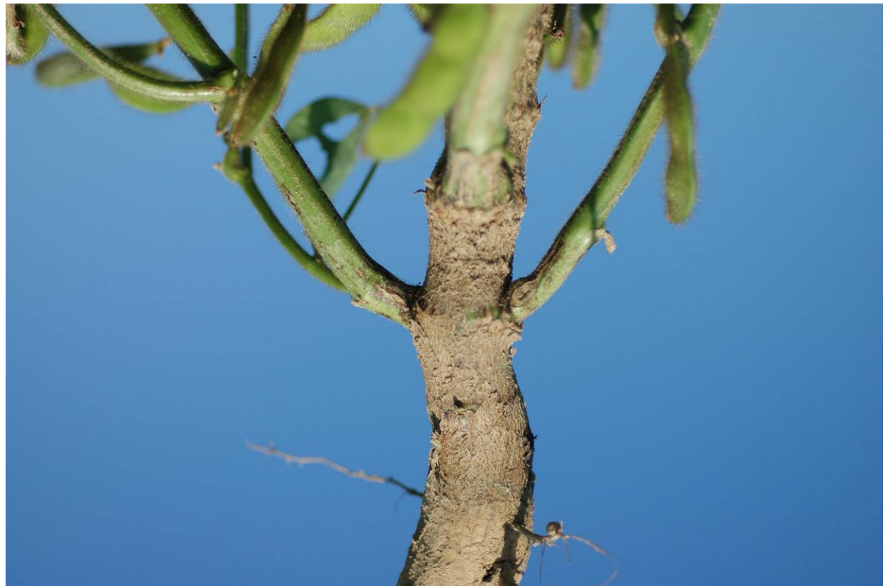
Photo 4. Soybean plant in the R6 or Full Seed stage showing side branches growing from unifoliate leaf nodes (lower two branches visible coming off the main stem) and at a 90 degree angle from the unifoliate leaf nodes is a side branch growing from the first trifoliate node.

By the time full-season on single-cropped plants reach the high numbered V-stages, there can be a question as to how many nodes have been made by the plant. This often occurs in rapidly growing plants especially when initial growing conditions were favorable for rapid germination and growth. In such cases, the identity of the cotyledon nodes, the unifoliate nodes, and the first trifoliate note can be confused. In photo 4 below, note how the two lowest side branches off the main stem highlight the placement of the unifoliate nodes as 90 degrees from the other branches occurring at the trifoliate nodes. The trifoliate leaf nodes occur alternately up the main stem.