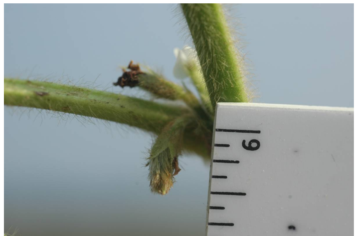
Photo 1. Soybean pod about 3/16 of an inch long (about 5 mm) at one of the four uppermost nodes on the main stem with a fully developed leaf looks very small.

The R3 or Beginning Pod stage is illustrated in Photo 1 below. Beginning Pod occurs when a pod 3/16 of an inch (about 5 mm) has formed at one of the four uppermost nodes on the main stem with a fully developed leaf. At least half the plants in the field must be this stage for the field to be called in the Beginning Pod stage. Drought and other stresses at this stage can cause pod abortion or lead to pods with fewer seeds per pod that would have occurred with the stress. Some flowers are still blooming and can replace dropped pods if the stress causing pod drop is eliminated.