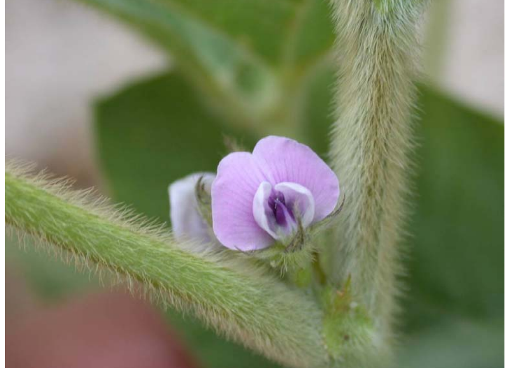
Photo 3. Close-up of leaf axil with open flower on a soybean plant.