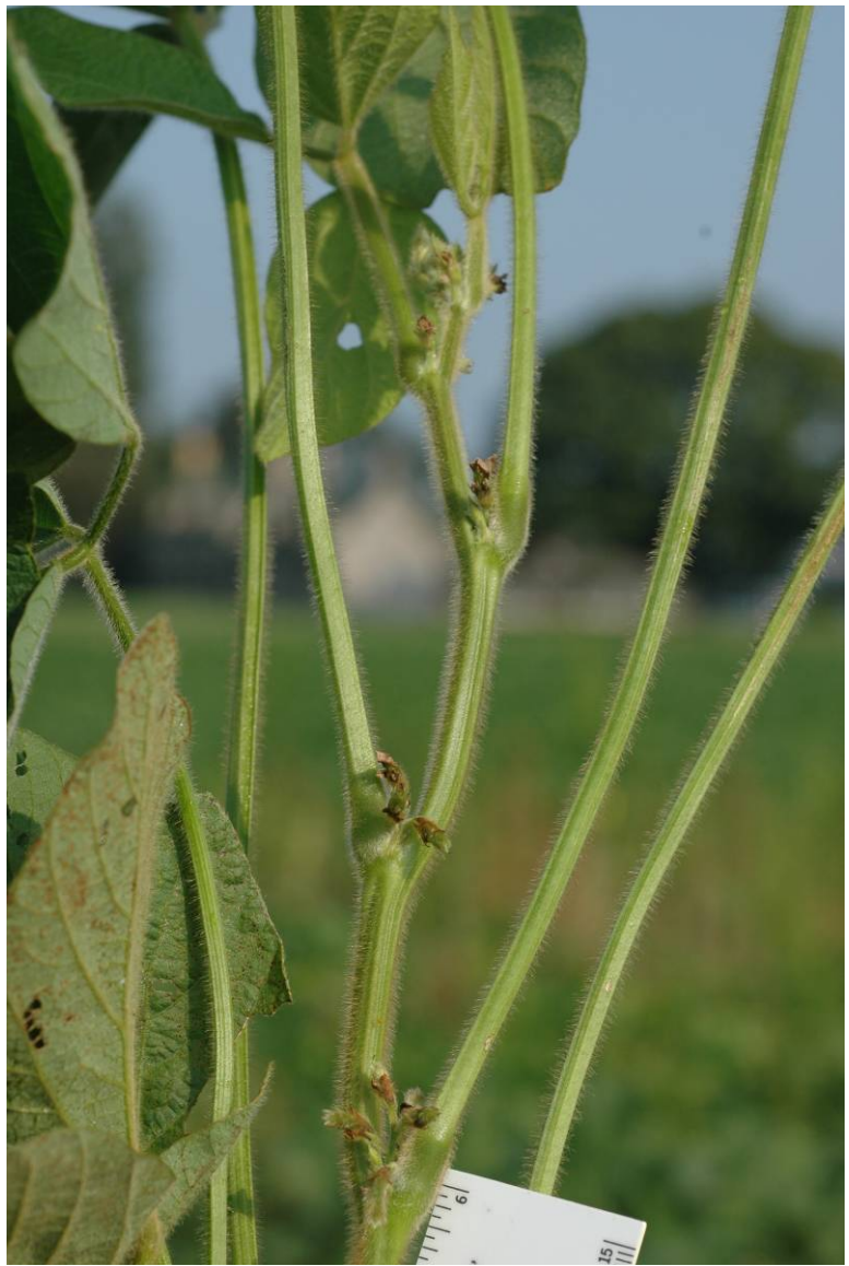
Photo 2. Soybean plant in the R3 or Beginning Pod stage at which time a pod 3/16 of an inch long (about 5 mm) has formed at one of the four uppermost nodes on the main stem with a fully developed leaf

The Full Pod stage (R4) occurs when half the plants in the field have a pod <sup>3</sup>/<sub>4</sub> of an inch long (about 19 mm long) at one of the four uppermost nodes on the main stem with a fully developed leaf. Flowering is about complete at this stage so stresses that cause serious pod drop and potential yield loss are unlikely to be made up other than by an increase in average seed size if the stress is removed. This limits the potential for yield recovery from stress conditions at this and later growth stages.