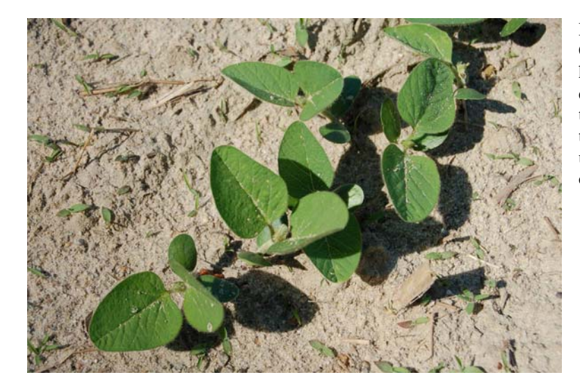
Photo 1. Soybean plants in the VC or Cotyledon stage since the unifoliate leaves have unrolled sufficiently that the leaf edges to not touch and the next leaf (a trifoliate leaf) has not grown enough that the leaf edges of the three leaflets have unrolled enough to no longer touch.

As mentioned in the previous article, I will continue the description of soybean growth stages and illustrate the cotyledon stage with a few photos. You may wish to refresh your memory of the definitions covered earlier but the second stage observed in the field is called VC or the Cotyledon Stage. VC begins when the unifoliate leaves have unrolled sufficiently that the leaf edges do not touch (Photo 1-2 below). The stage continues until V1 or the First Node stage when there are fully developed unifoliate leaves at the unifoliate nodes which indicates that the first trifoliate leaves have unrolled sufficiently that the leaf edges do not touch.