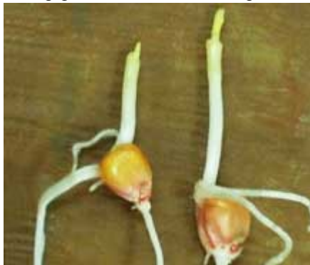
Imbibitional chilling and cold injury. Note club-shaped coleoptile and underground emergence. (See photo below)