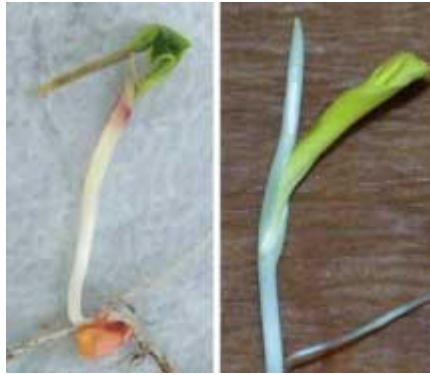
Fused coleoptile/bursting on the side.