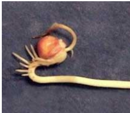
Flooding/chilling damage – note dead primary root (above seed) and adventitious roots on mesocotyl (below, left of seed).