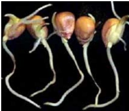
Flooding damage – note necrotic area of each root above root tip.