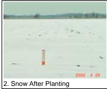
2. Snow After Planting