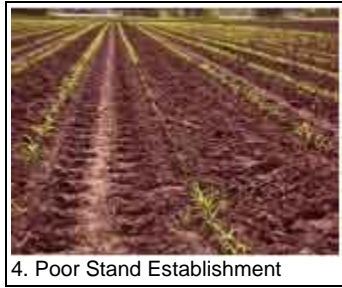
4. Poor Stand Establishment

1. Good spring weather in Quebec, Canada in 2002 allowed for planting on April 24. 2. Snow occurring five days later covered the field. Cold imbibition resulted in seedling damage and stand loss like that shown in pictures 3 and 4, respectively.