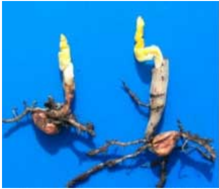
Imbibitional chilling and cold injury. Note club-shaped coleoptile and underground emergence. (See photo above)