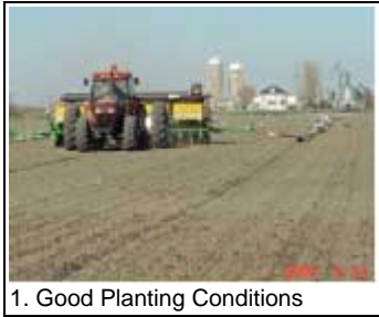
1. Good Planting Conditions