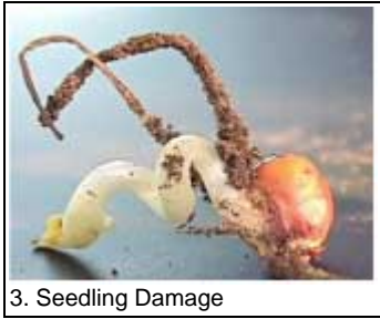
3. Seedling Damage